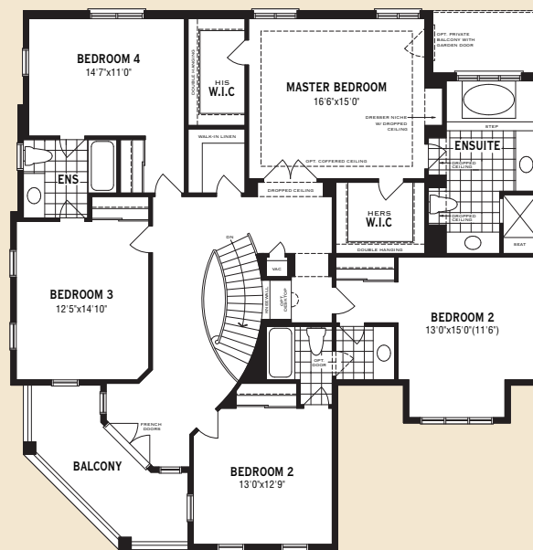
Second Floor Plan 5 Bedroom Plan With 3 Ensuites